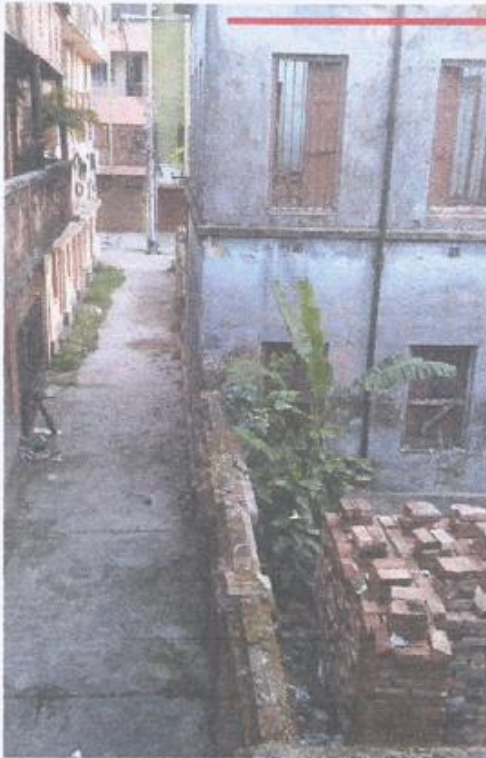
A (ABOVE): INITIAL STATUS