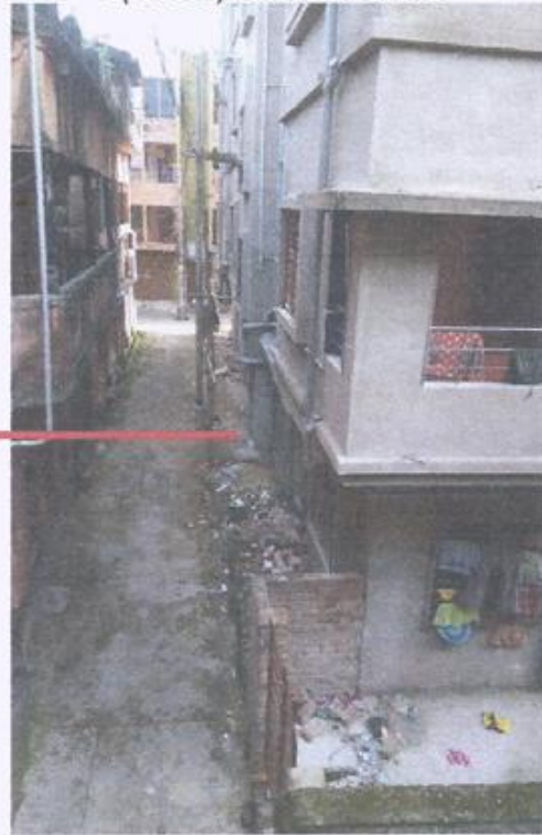
D (BELOW): CURRENT STATUS