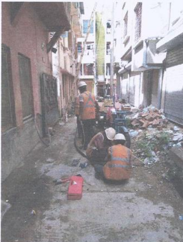
ATTEMPTED CONNECTION ON 13TH AUG 2022, THAT WAS OBJECTED TO