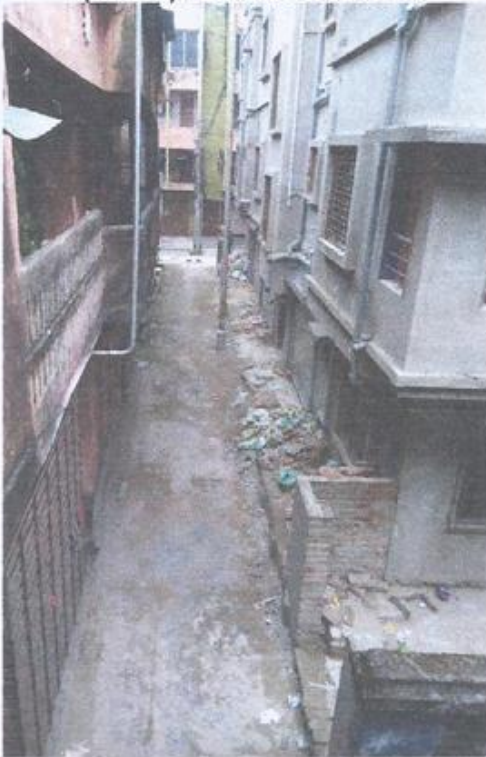
C (BELOW): BEGINNING OF ORDER