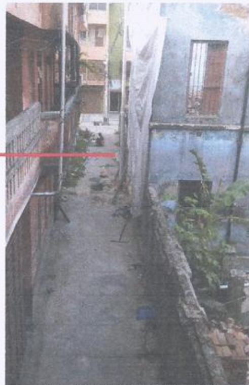
B (ABOVE): DEFUNCT CESC POST